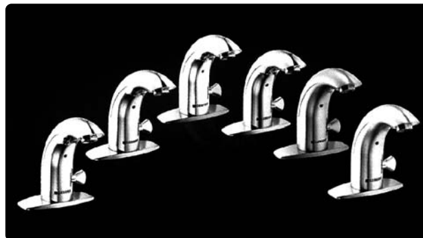
Geberit offers a variety of finishes to complement every bathroom decor

• In the public sector where high frequency use is the norm, the Geberit Infrared Faucet quickly pays for itself. Its electronically controlled infrared optics adjust automatically for minimum energy consumption. You will save water, energy and money, while spending less time on facility maintenance. The battery is reliable for up to 200,000 hand washes (three years of use).