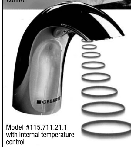
Model #115.711.21.1 with internal temperature control